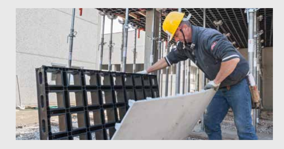
Easy to clean