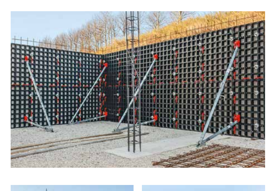
Universal 3 in 1 – walls, columns and slabs