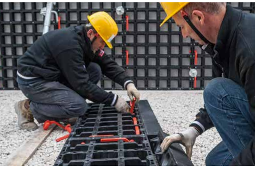
Healthy working Hammer free usage